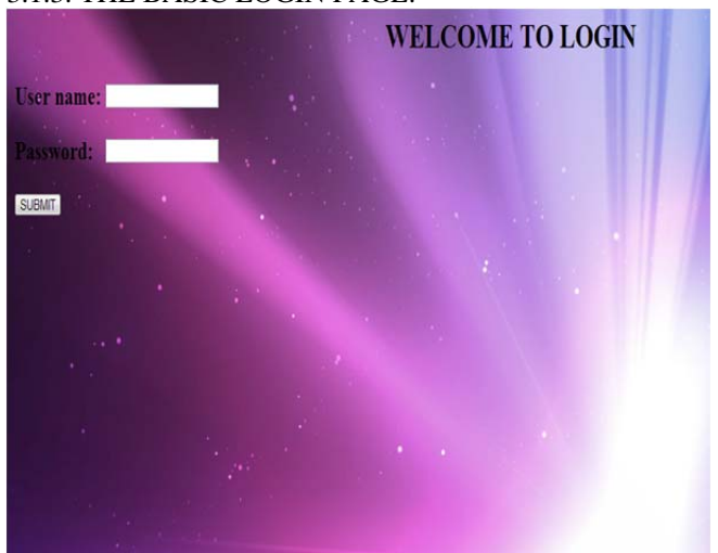
DIG: Basic login page