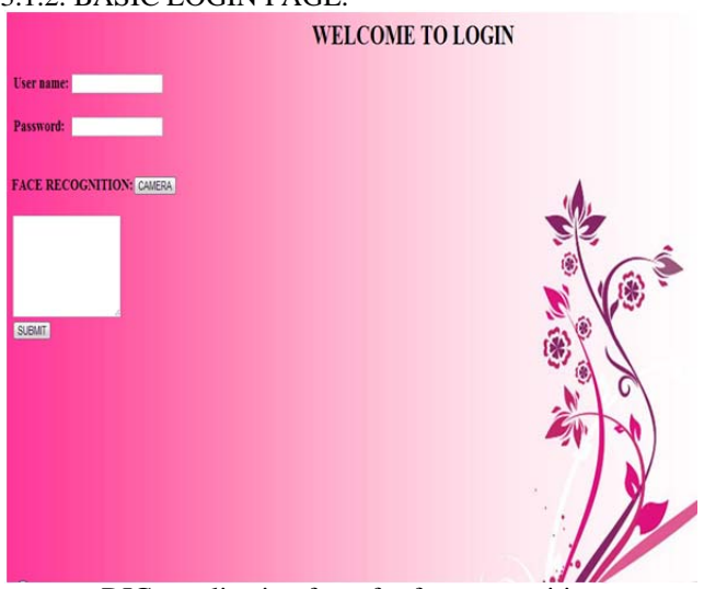
DIG: application form for face recognition